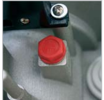
Oil lubrication of the gears for max duration.