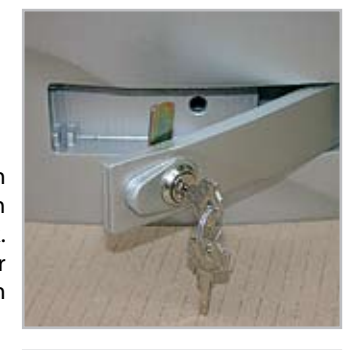
Release with aluminium lever and lock. Micro switch for stop function